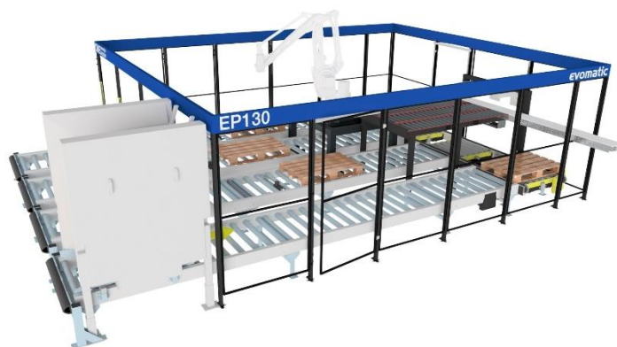
VIEW FROM THE SIDE

EP130 is a completely independent robot cell that with high precision and pace sorts out products from a conveyor to three different pallet locations. The cell is a standard equipment but has excellent opportunities for easy customer adaptation to specific products and demanding needs.