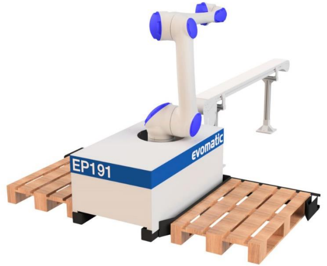
VIEW FROM THE SIDE

EP191 is a completely independent robot cell that palletizes directly from a conveyor to two fixed pallet positions with high precision and pace. The cell is a standard equipment but has excellent opportunities for easy customer adaptation to specific products and demanding needs.