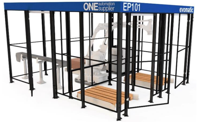
VIEW FROM THE SIDE

The EP101 is a completely independent robot cell that picks varying materials from a conveyor belt to a pallet with high precision and pace. The equipment also has interlayer handling. The product is a standard equipment but with excellent opportunities for customization according to specific products and demanding needs.