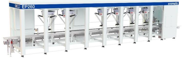
VIEW FROM THE SIDE

EP260 is a completely independent robot cell that with high precision and pace picks products from a conveyor into customer specific packaging. The cell is a standard equipment but has excellent opportunities for customization to specific products and demanding needs.